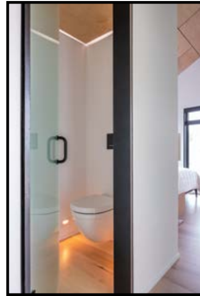
TOP LEFT: A double vanity with matte black hardware has plenty of space and storage for the family. TOP RIGHT: A water closet is tucked away in the primary bathroom. BOTTOM LEFT: The ceiling is prefinished maple plywood, as are the doors to the closet along the far wall.

The mirrors are backlit and the large six-foot vanity top was moulded with a trough sink and single drain. “The cabinets and ceiling were constructed with prefinished maple plywood and the ceiling panels were installed without mechanical fasteners, so there are no penetrations through the face, a trade secret,” he says. The Jotul propane fireplace fits neatly into the angled window corner where they can see into the field beyond. A steel roof, horizontal brushed siding on the new addition and fresh white paint on the existing stucco updates the exterior.