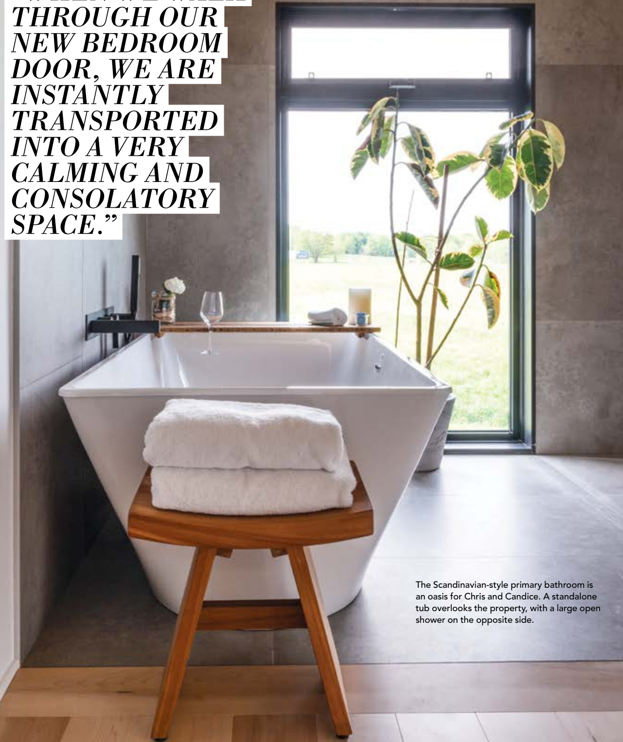
The Scandinavian-style primary bathroom is an oasis for Chris and Candice. A standalone tub overlooks the property, with a large open shower on the opposite side.

“WHEN WE WALK THROUGH OUR NEW BEDROOM DOOR, WE ARE INSTANTLY TRANSPORTED INTO A VERY CALMING AND CONSOLATORY SPACE.”