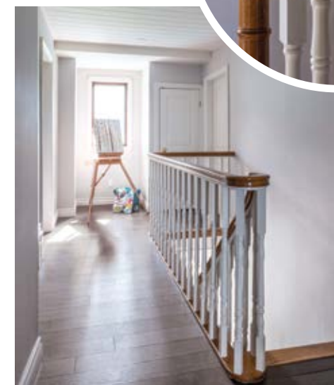
Traditional balusters are an elegant detail on the stairway.