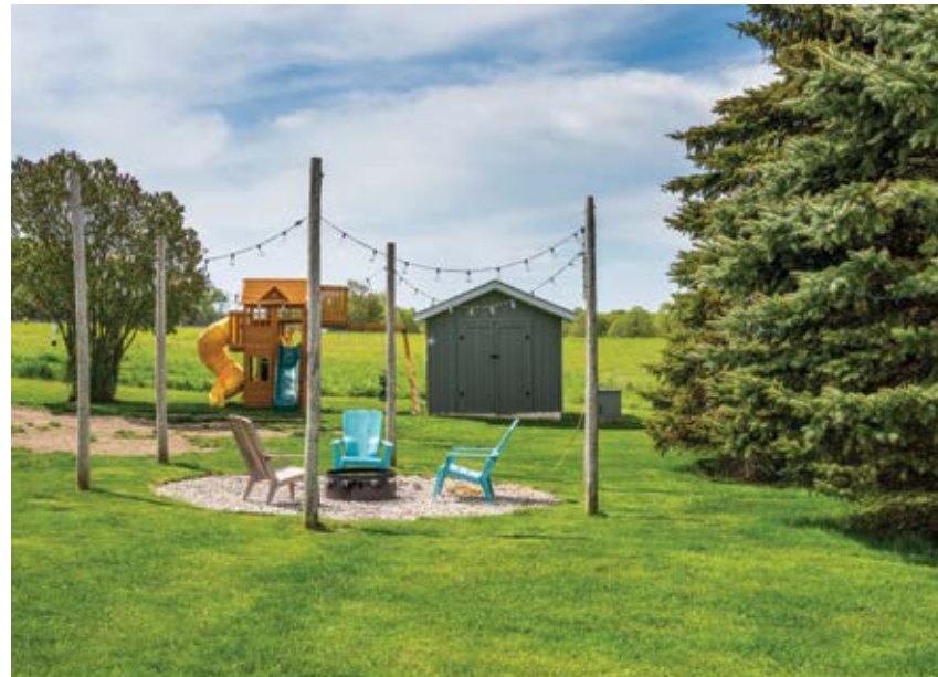
TOP LEFT: The modern addition has massive windows that flood the room with light. BOTTOM LEFT: Two of the couple's three daughters, Ruby and Poppy, enjoy running around on the lawn with the family dog, Rubble. BOTTOM RIGHT: A fire pit and play set make the most of the backyard.