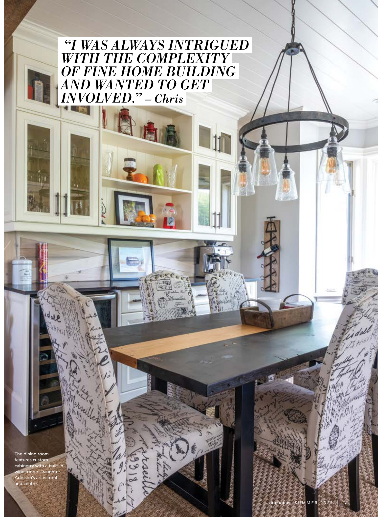
The dining room features custom cabinetry with a built-in wine fridge. Daughter Addison's art is front and centre.

"I WAS ALWAYS INTRIGUED WITH THE COMPLEXITY OF FINE HOME BUILDING AND WANTED TO GET INVOLVED." – Chris